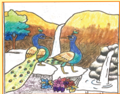
Tapaswani Patra - 3'B'