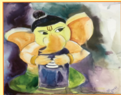
Mansi - 7'C'