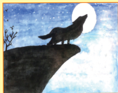
Guja Kumari - 3'C'