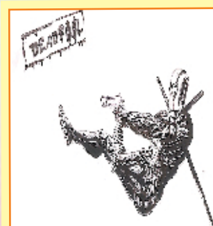
Harsh Raj - 7'C'