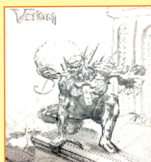
Harsh Raj - 7'C'