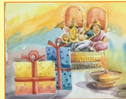
Mansi - 7'C'