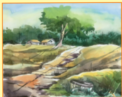
Mansi - 7'C'